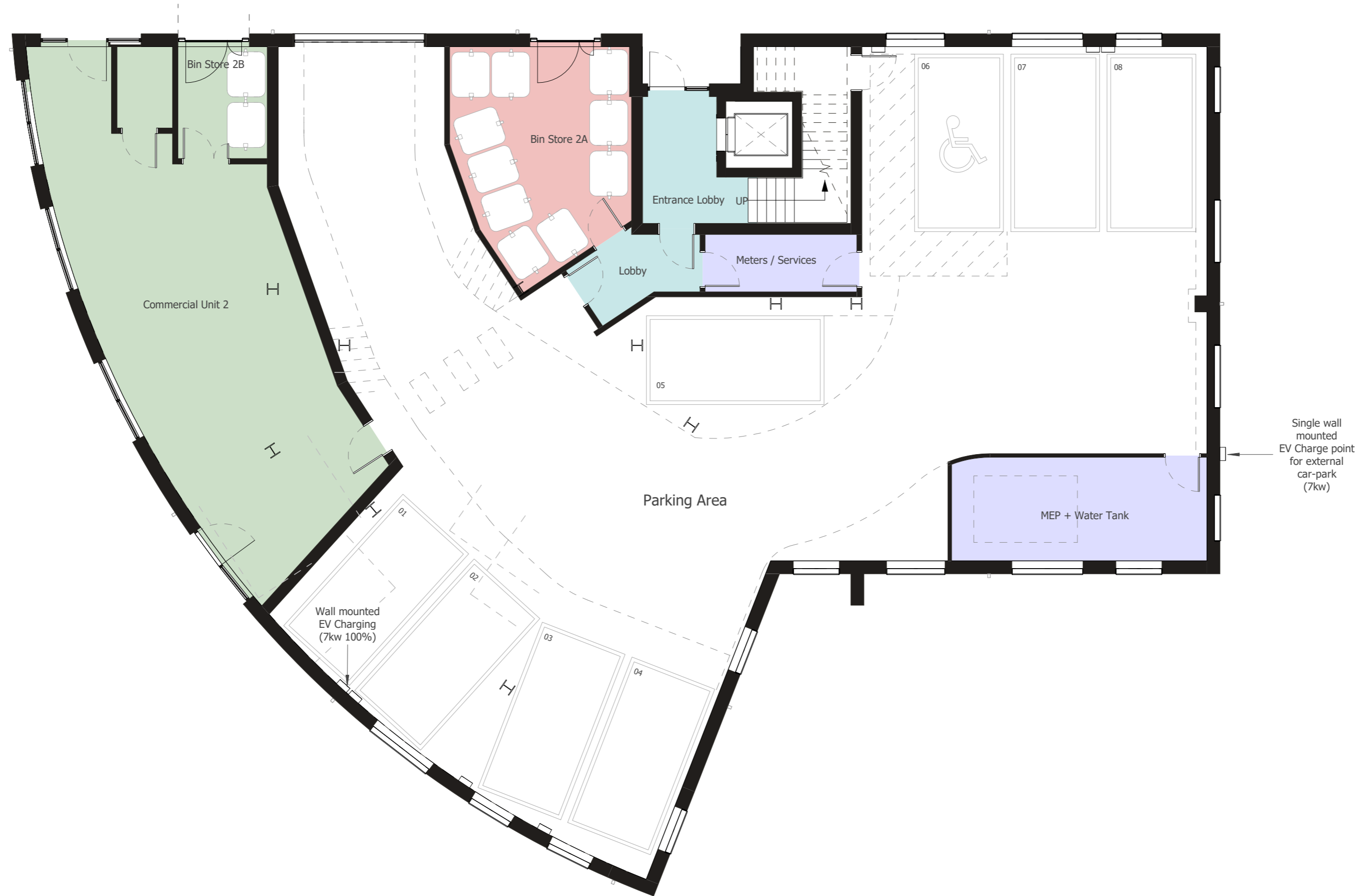
Ground Floor Plan 1 : 100